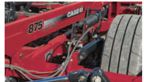
Coordinated control: optimize all components