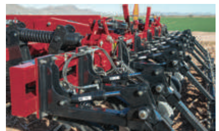
Crumbler pressure: achieve consistent clod sizing