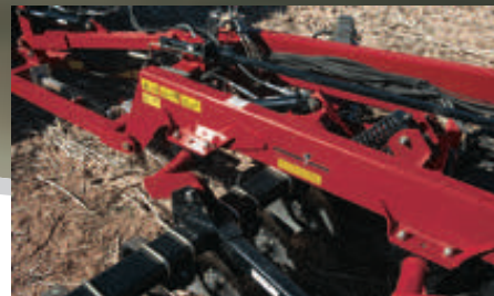
Disk gang depth: create agronomic residue cover