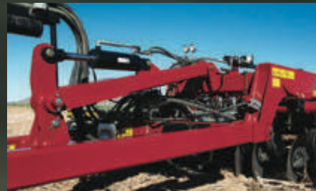
New hydraulic fore/aft positioning: maintain consistent agronomic output