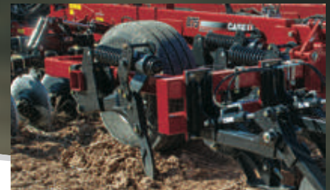
Shank depth: target the compaction layer