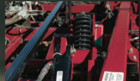
Disk gang pressure: reduce pressure on frame