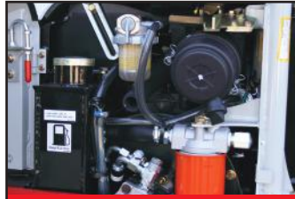
Convenient Filter Access