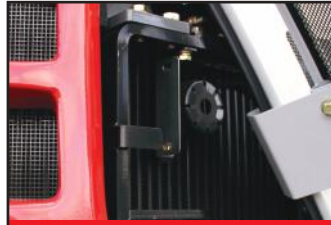
High Capacity Cooling