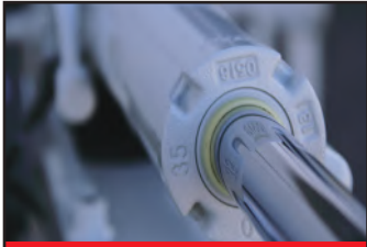
Top Mounted Cylinder