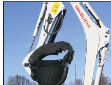
Long Arm w/ Thumb Mount