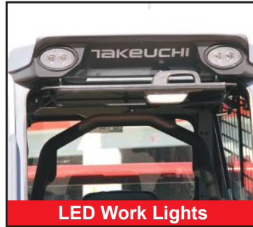
LED Work Lights