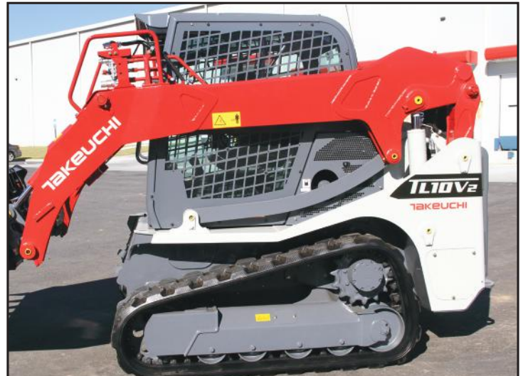
Vertical Lift Path for Balance and Stability