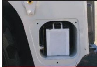
Battery Access Panel