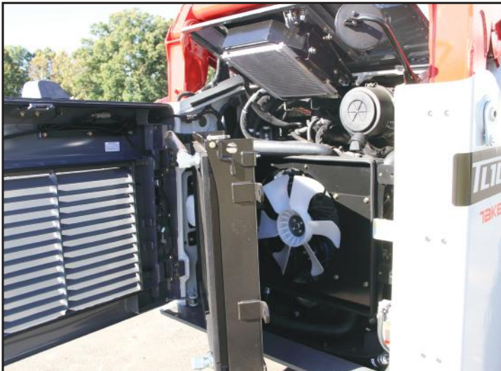
Convenient Service and Maintenance Access