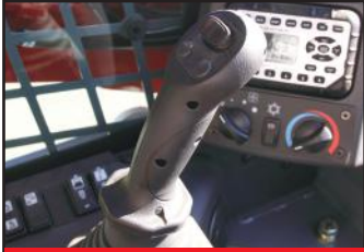
Pilot Operated Controls