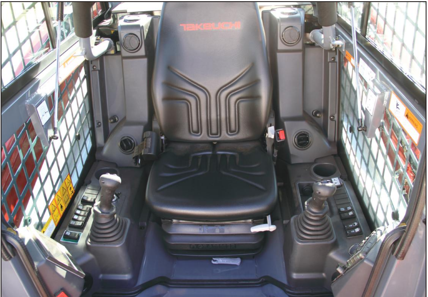
Spacious operator's platform with easy to reach controls and switches.

Equipped with the Takeuchi Fleet Management (TFM) telematics system critical information such as machine health, condition, diagnostics, and location can be viewed remotely providing valuable real time machine information that will help control costs and keep downtime to a minimum. The Takeuchi Fleet Management system is a real value as the service is free for the first two years of machine ownership.