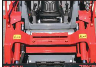
Lower Cross Member & Step