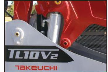
Oversized Lift Cylinders

The TL10V2 vertical lift track delivers excellent functionality, performance, comfort, and serviceability. It features a completely redesigned operator's station with a 5.7" color multi-information display and updated rocker switches that control a wide range of machine functions. Cab models have a smooth, low effort overhead door that improves entry and egress and enables the loader to be operated with the door in the raised or lowered position. An updated undercarriage with a wide block quiet ride track system provides better flotation, improved ride quality, and a reduction in noise and vibration. A powerful 74.3 horsepower engine meets the latest